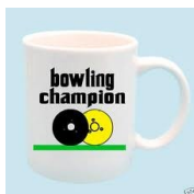
Not the real thing. It's all we could afford for you.