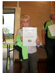
Me! I don't believe it! I actually won!