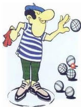
Pardon Monsieur! A polish will send it down vite vite