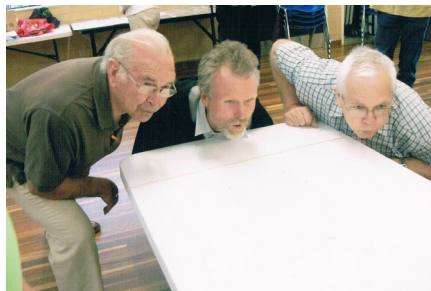
We'll huff and puff until we get a goal.

(not their feet) but their well honed huffing and puffing skills.