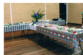
Oh Dear! Where to start!!

Everyone was a full as a goog. All that was left were crumbs. Not even enough for the ants. The night was thoroughly enjoyed by all.