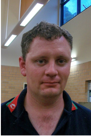
Why so serious PT?

After a little bit of snooping and perhaps a bit of underhanded bribery we came up with some very interesting facts about our resident representative from Australia Post.