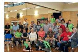
Can you recognise anyone?

All in all 53 people had attended our Xmas party meeting. Cameras were flashing as the festivities took place. It took a bit of cajoling and arranging but at last the BEPS ruffians were in one place for the PHOTO.