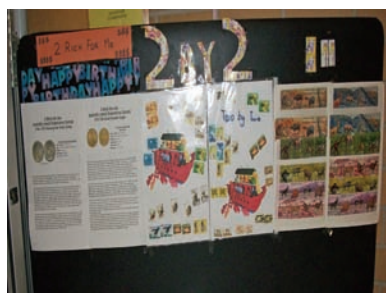
Birthday display from our juniors

Another 12 months have rolled around and here we are — two years young. We have grown in members — both senior and junior. After a short (I mean really short) meeting we started the celebrations. Games, food and fun was the or-