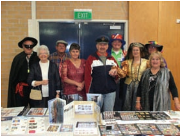
Gathering of Stars.

At our June meeting stars of the silver screen, radio and history arrived. Zorro chaired the meeting assisted by stars who were incognito.