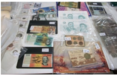
A selection of lots on offer

On the last weekend in May, we held a stamp and coin auction at the Boambee East Community center. It was an extraordinary night. The implementation of postal bids was to prove to be a decisive factor that led to the success of the night.