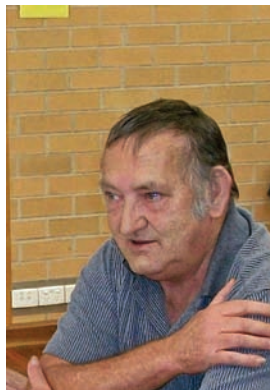
Our esteemed circuit manager