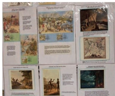
"To Bridge The Gap"

This display has won several awards, both gold and silver, in many exhibitions through out Australia. Thank you for allowing us to see this magnificent display.