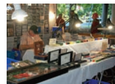
The Stamp and Coin stall, Coffs Harbour uptown Markets

That's it. A very busy 3 months. Just a reminder that fees are now due. Welcome to all new members. If you're in Coffs on a Sunday check out the coin and stamp stall. See the people in green shirts.