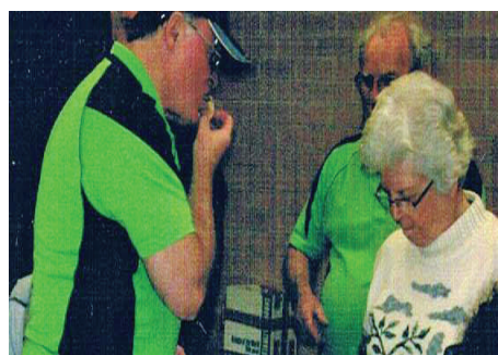
Finger lickin' good.

The birthday cake was spectacular. Again the ingredients were donated by Coles Toormina and was baked and decorated by our resident Master Baker. Thanks to him. Not only was it a feast for the eyes but also for our stomachs.