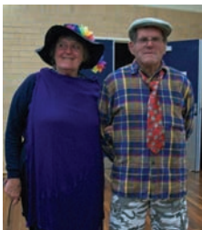
Ma and Pa Kettle dropped in.

King Henry VIII's wife, Anne Boleyn, was accompanied by the brash American, Uncle Sam. Yes. She did keep her head this time.