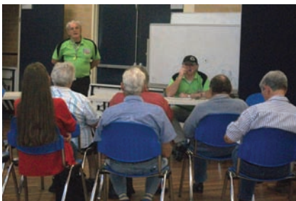
Bidding was fast and furious

The number of lots submitted for sale went beyond our expectations. A wide array of both stamps and coins was gratifying to see. A good sized crowd attended. There was a gentleman who turned up not realizing it was a stamp and coin auction. He soon left—embarrassed but quite jovial.