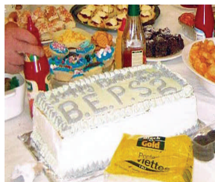
Too good to eat!

the amount and variety of food on the table for us. You name the party fare and we had it.