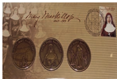
It didn't take long for this to be sold.

As with our previous auctions we averaged an astounding 65% sales record. The attending crowd of bidders had examined the lots with great care and by the way they put forward their bids it could be seen that they knew what they wanted and bid accordingly. There was much friendly rivalry as the night progressed.