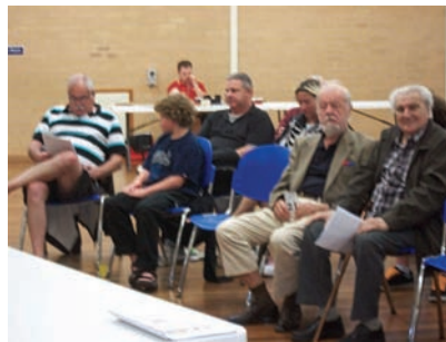
Who's confident about getting their lots then?

One person attending was so keen to get a certain lot that he bid furiously against a postal bid until the lot was his. It was then discovered by the secretary that the postal bid was the bidder's own. Of course it was worked out much to the bidder's relief.