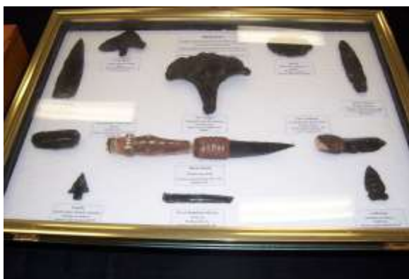
Col Davidson's display of obsidian knives and sharp edges