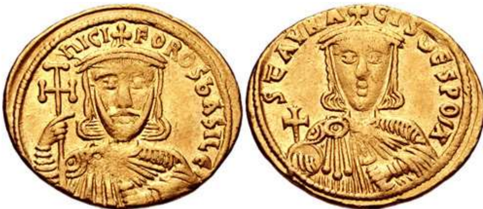
Nicephorus I, with Stauracius. 802-811. AV Solidus (21mm, 4.37 g, 6h). Constantinople mint. Struck 803-811. Crowned facing bust of Nicephorus, / Crowned facing bust of Stauracius, .

However unlikely the title of this article, it has been recorded by several historians. Nicephorus I became emperor in 802 after deposing his predecessor in a coup and associated his son Stauracius as deputy emperor. The empire was in some strife at the time and Nicephorus set out to rectify matters, especially with regard to the Bulgarians. Nicephorus inflicted two heavy defeats on the Bulgarians and then pursued them into mountainous country, unwisely as it turned out. His army was ambushed and he himself killed in the skirmish. His body would have been recognised by his armour and probably general decorations. The top of his skull was removed and appropriately mounted with a stem and probably handles to create a large goblet for use by the Bulgarian king. Stauracius, now the emperor, was seriously wounded but managed to escape with the remnant of the army. Because he seemed unlikely to recover he abdicated after a reign of a few weeks in favour of his brother in law Michael.