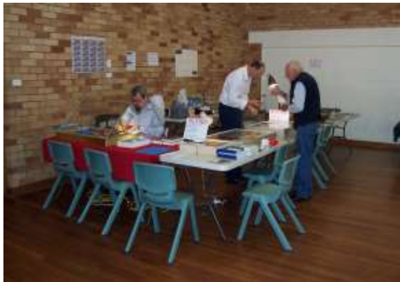
The Wynyard Coins table